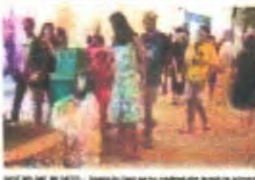
A group of people walking on a beach, some carrying bags.

I t is an all-around island that is deserving of the name Boracay. The island has been closed for a year to allow the island to recover from the damage caused by the closure. The island is now open to tourists and is a beautiful sight to behold.