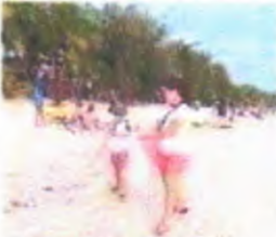
A group of people walking on a beach, some carrying bags.

M ay 1 Minister Ferdinand R. Marcos Jr. is urging Filipinos to be humans, not plastic. He said that the island of Boracay is a beautiful sight to behold. The island has been closed for a year to allow the island to recover from the damage caused by the closure. The island is now open to tourists and is a beautiful sight to behold.