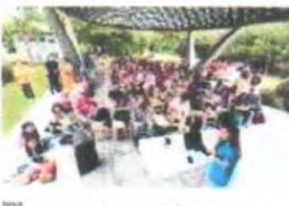
Ecotourists are visiting the restored wetland. The restored wetland is now a beautiful, restored wetland that is now a popular destination for ecotourists.

Urbanization is a major threat to wetlands. As cities and towns expand, wetlands are often the first to be lost. This is because wetlands are often located in low-lying areas that are easy to develop. The loss of wetlands is a major concern for environmentalists, as it can have a significant impact on the local ecosystem. Efforts are being made to protect and restore wetlands in the Metro area, and this is a critical step in ensuring the long-term health of the environment.