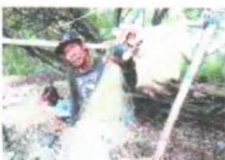
Restoration workers in the Metro area are working to restore wetlands. The restored wetland is now a beautiful, restored wetland that is now a popular destination for ecotourists.

When the last remaining remnant of the Metro area's wetlands was threatened, a coalition of environmentalists and local businesses joined forces to save it. The result is a beautiful, restored wetland that is now a popular destination for ecotourists. The restoration project was a major success, and it has set a precedent for other wetland restoration projects in the Metro area. The restored wetland is now a beautiful, restored wetland that is now a popular destination for ecotourists. The restoration project was a major success, and it has set a precedent for other wetland restoration projects in the Metro area.