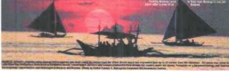
The Boracay island is a beautiful sight to behold. The island has been closed for a year to allow the island to recover from the damage caused by the closure. The island is now open to tourists and is a beautiful sight to behold.

T he Boracay island is a beautiful sight to behold. The island has been closed for a year to allow the island to recover from the damage caused by the closure. The island is now open to tourists and is a beautiful sight to behold.